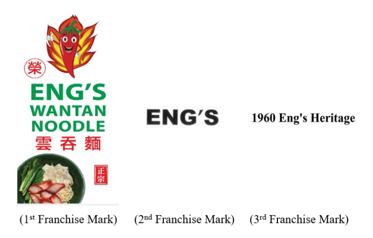
Figure 5: The Franchise Marks

(c) the 3<sup>rd</sup> Franchise Mark, identified by Trade Mark No. 40201920188T, was registered on 17 September 2019. [note: 107]